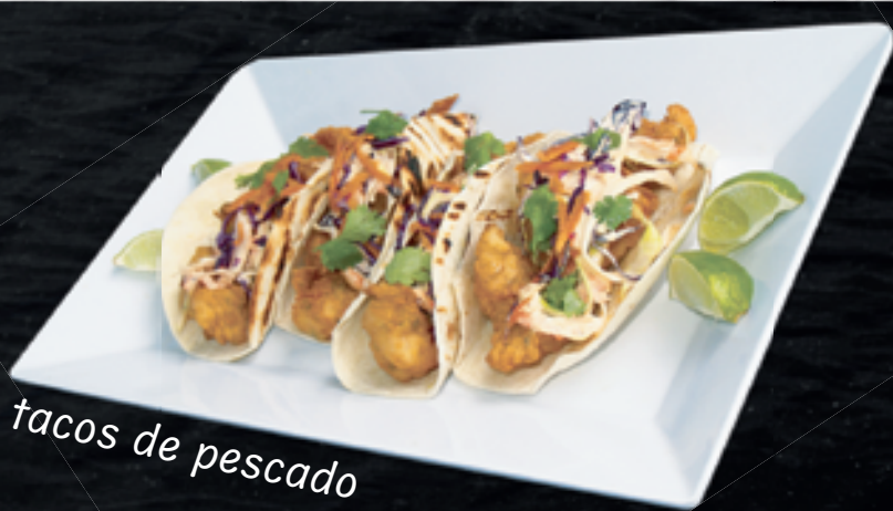
tacos de pescado