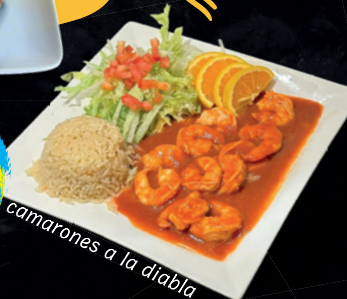
camarones a la diablo

Large Fried Tilapia fish with our spicy sauce