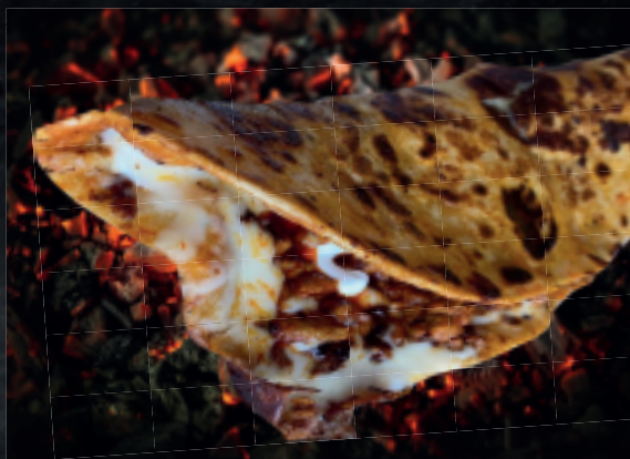
quesadilla de comal

3 quesadillas cooked directly on the embers add chicken or chorizo +$1.99