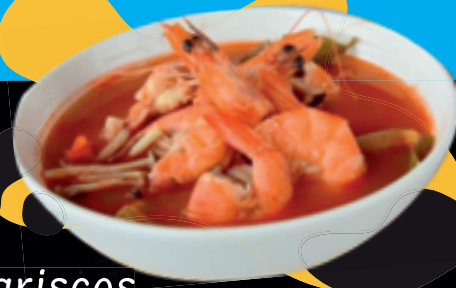
sopa de mariscos