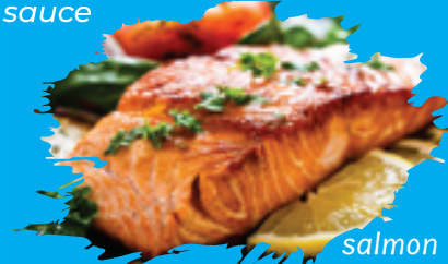
salmon al mango

Grilled Salmon topped with a slightly mango sauce