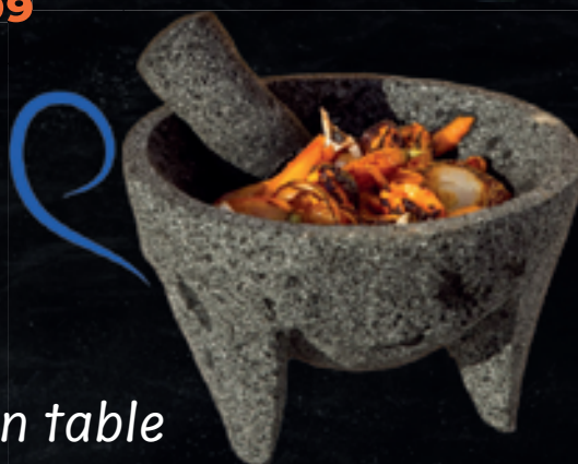
salsa on table