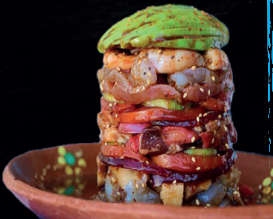
torre de mariscos