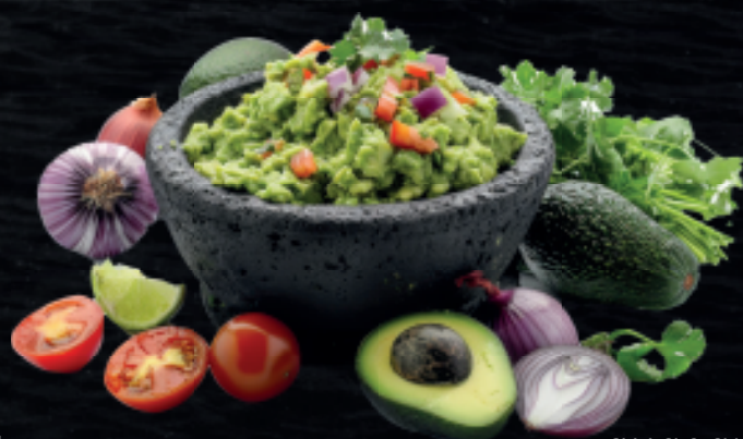
guacamole on table