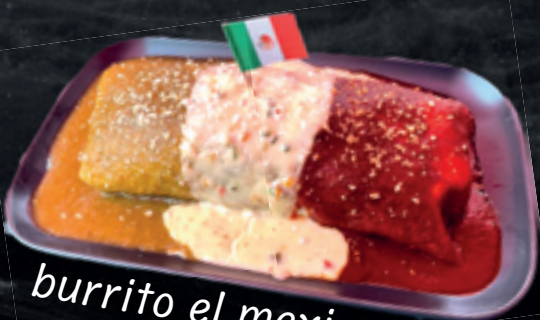
burrito el mexicano